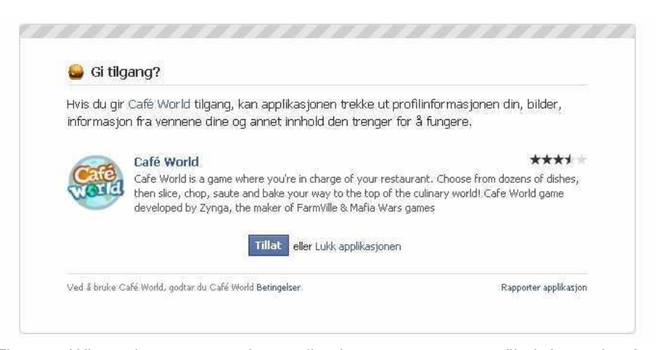
Figure 3 When given access, the applications can extract profile information from the user and the user's friends

Third-party applications are applications developed by someone other than Facebook or the user himself – something that is possible on "open" platforms such as Facebook. Examples of such applications are games, quizzes, sharing of information from external websites or other activities that are published and operated by a third party. Information about the user is disclosed when using third-party applications, often along with information about the user's friends, see Figure 3<sup>9</sup>.