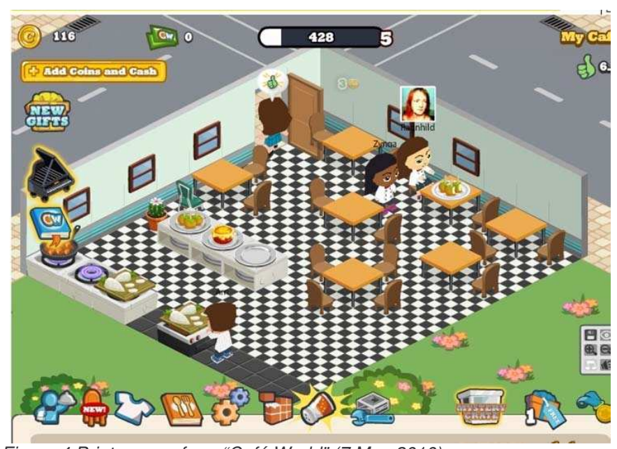
Figure 4 Print screen from "Café World" (7 May 2010).

The avatar with a profile picture is one example of how Café World extracts profile information about a user's Facebook friend, "Ragnhild", and her profile picture. "Ragnhild" had not granted access to Café World and continued to appear in the game even after she had blocked the application, see Figure 4.