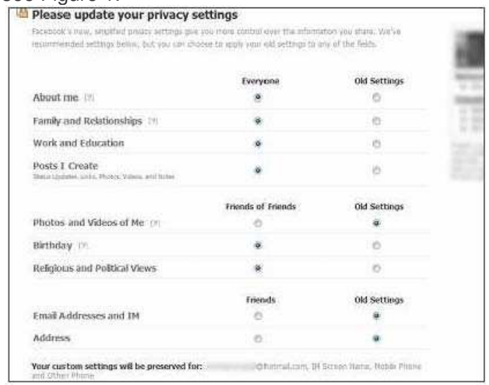
Figure 1 "Facebook's new, simplified privacy settings give you more control over the information you share". Recommended settings when logging in after the changes were made.

Facebook has changed its terms, conditions and functionality on several occasions, and following a change in December 2009 members were urged to accept the new privacy settings, see Figure 1.